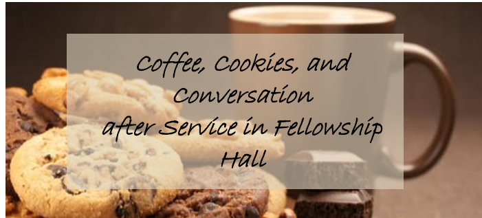
Coffee, Cookies, and Conversation after Service in Fellowship Hall