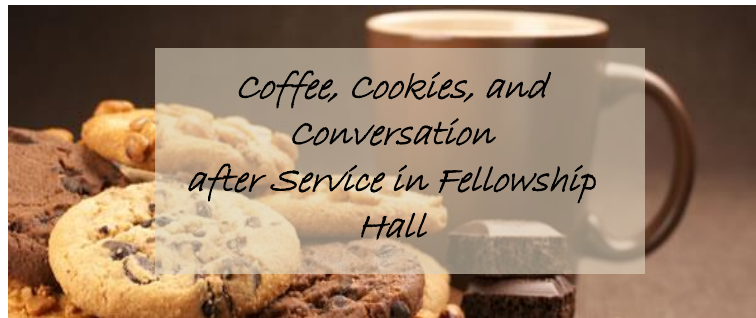
Coffee, Cookies, and Conversation after Service in Fellowship Hall